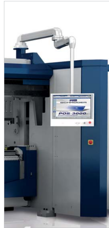
Software control of a folding machine